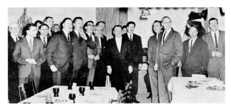
Happy "sing singers" just released from prison and enjoying fellowship together are members of the Sunday Evening Spokesman Club of Chicago.

Foundations for future club activities are already being laid.