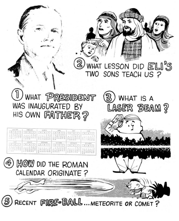
See page 8 for Answers