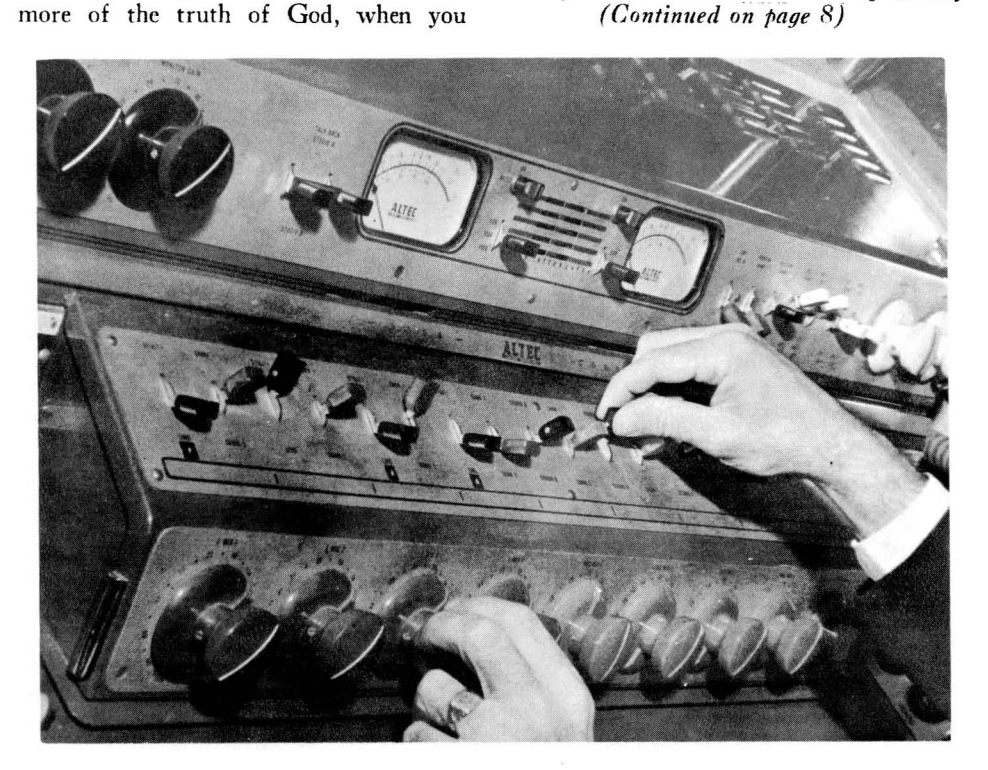
The magic of modern-day recording technique brings The PLAIN TRUTH magazine to the physically blind each month.

Since The PLAIN TRUTH and the rest of the literature of God's Work are not available in Braille, the physically blind had to remain spiritually (Continued on page 8)