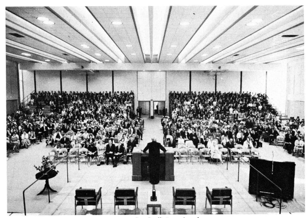
Pasadena congregation in first services in new gym.