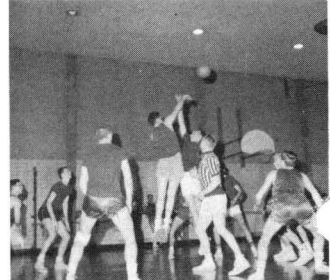
You are missing some thrill packed games.