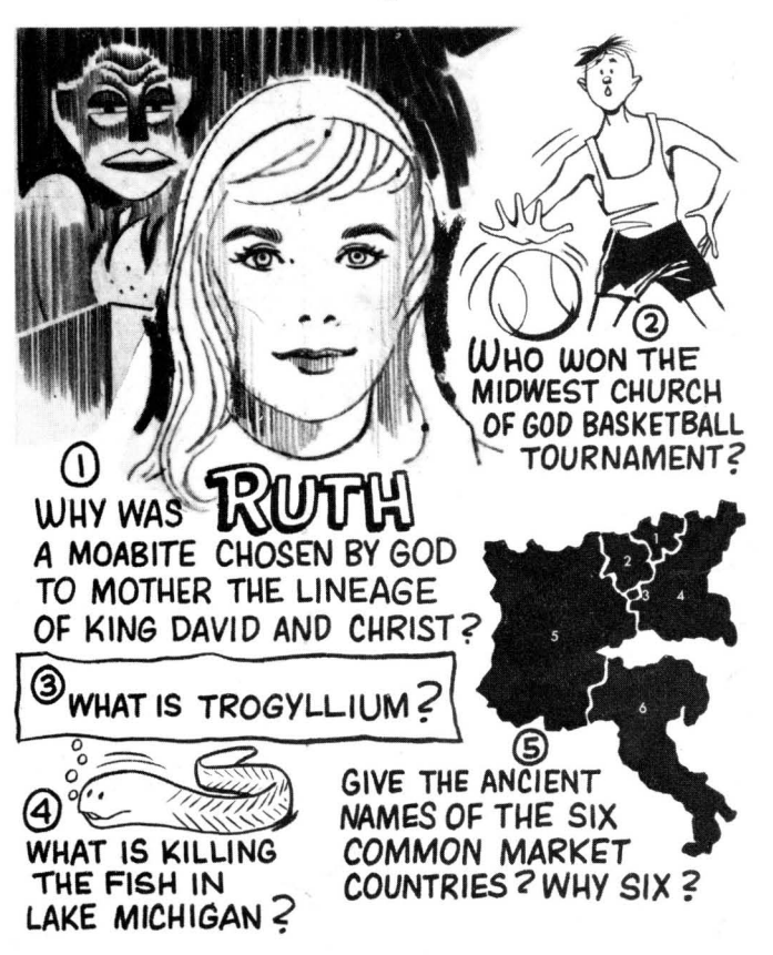
See page six for answers