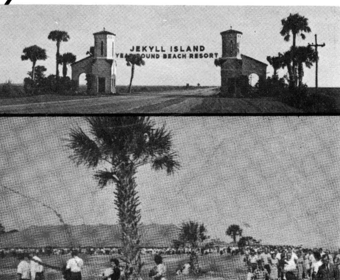
Jekyll Island, Georgia