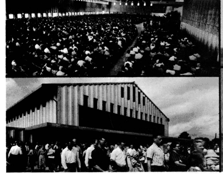
Big Sandy, Texas