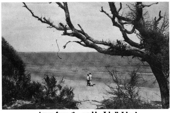
Away from the world-Jekyll Island