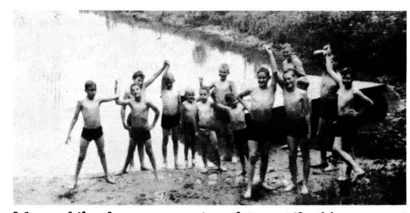
Meanwhile, boys are assigned in a "buddy system" prior to swimming.

Holland site to various points about the state, Grand Rapids included. Their "stamp" was imprinted upon every city they entered. They would go to their church two or three times on Sunday. This was indeed a pious people, believing they were God's elect and all others were lost.