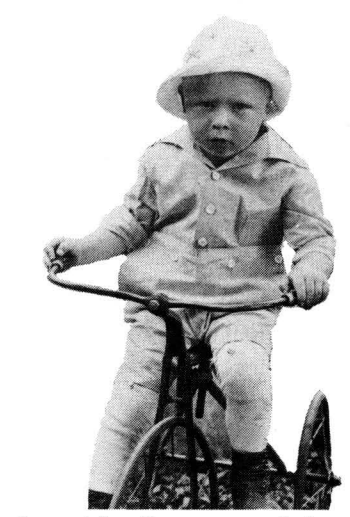
A certain Deacon aged four—guess who! Note those fancy wheels! See next issue.

At the present time there are about one-hundred-eighty in Sabbath attendance at Grand Rapids. This is a foundation upon which God can build a larger church after stability has been achieved.