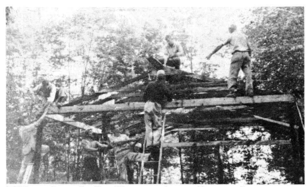
Elkhart-Grand Rapids members discuss knotty construction problem.

The two Elkhart Spokesman Clubs (sponsors), went "ALL-OUT" to make the occasion a gainful one—beginning with a "Camp-OUT" Saturday night, followed Sunday by a "Cook-OUT", a "Work-OUT", and a "Speak-OUT" (evening Spokesman's meeting). P.S. No "Drop-OUTS", but many lads of all ages reported home "Played-OUT"!