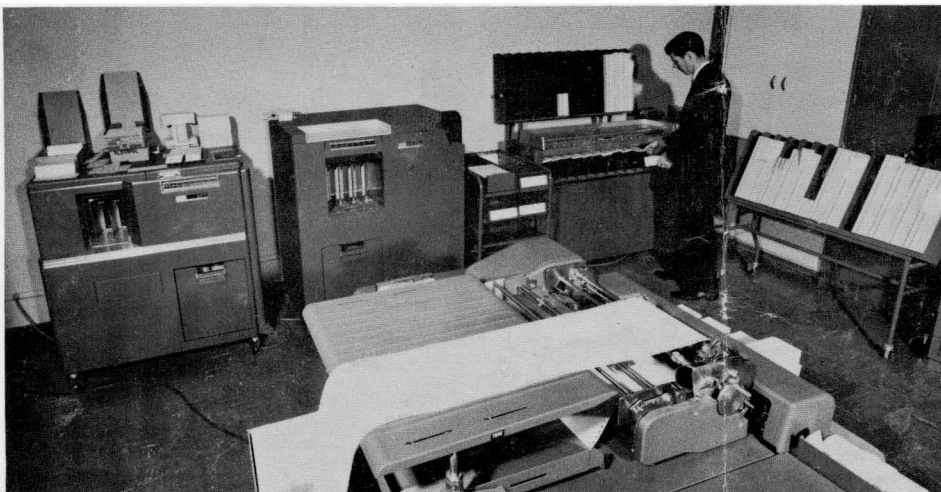
Streamlining through efficiency, speed, accuracy and multiplicity of purpose; these latest electronic additions to the Filing Department are condensing man-hours into electronic seconds. See these fantastic machines on your tour through Ambassador College Press.