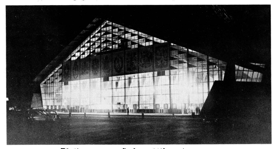
Blyth arena -- So long 'til next year.

We could see just a part of the beautiful garden that God has given (cont. on page 4)