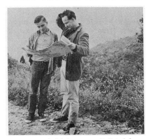
---right here---I think!

coming outing. On November 24, the Club will go on a fishing trip to Malibu to fish from late afternoon until dark. December 22 will be a surprise outing. On January 26th, the boys have scheduled a snow outing, pending on the weather conditions.