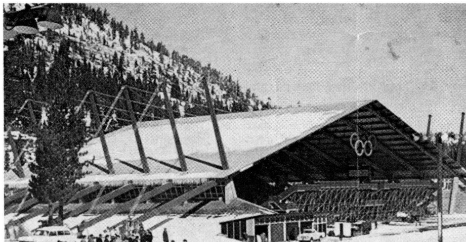
"Tabernacle; Squaw Valley"

God's own people met in two locations in the United States, as well as in London, England, and other parts of the world. Yes, God's Feast of Tabernacles is now being kept world-wide, giving us a little glimpse into the future when the whole world will keep the Feast in the millennium.