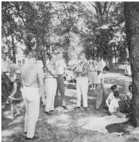
NORTH AURORA PARK

All who came spent a joyful day playing together and can look forward to another picnic next year.