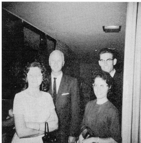
HOLIDAY INN, TYLER

Every day at the Feast brought about new things to do, different types of entertainment and interesting tours. We were entertained at each meeting with special music by either the Pasadena Chorale, New York Chorale, Chicago Chorale or Glade-water High School Chorale. Planned recreation such as roller skating, bowling and vimming was enjoyed by the younger members and by many of the adults. Many of us also indulged in fishing, boating and water skiing.