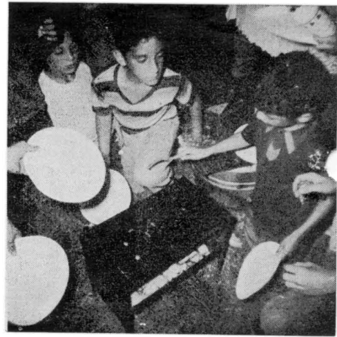
LOCUST EATERS at Boys Camping Trip

Thirty-two in all - something for which we can all be joyful, remembering that we, too, were once babes and, as many of us know, stumbling and tripping while trying to learn God's ways because of our own carnal natures. But, rejoice, my brethren, for with God's Holy Spirit we can do all things.