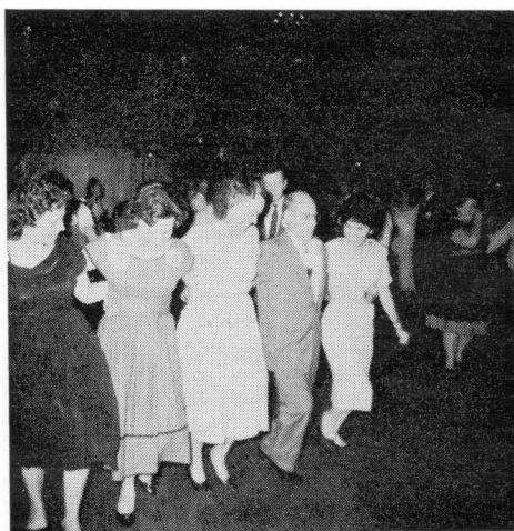
One of the recent, very successful Chicago Socials