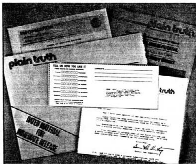
PT SURVEY PROMO — 25,845 public relations directors were sent (a) letter describing Plain Truth (b) sample issue (c) survey card to evaluate Plain Truth and/or request a subscription.