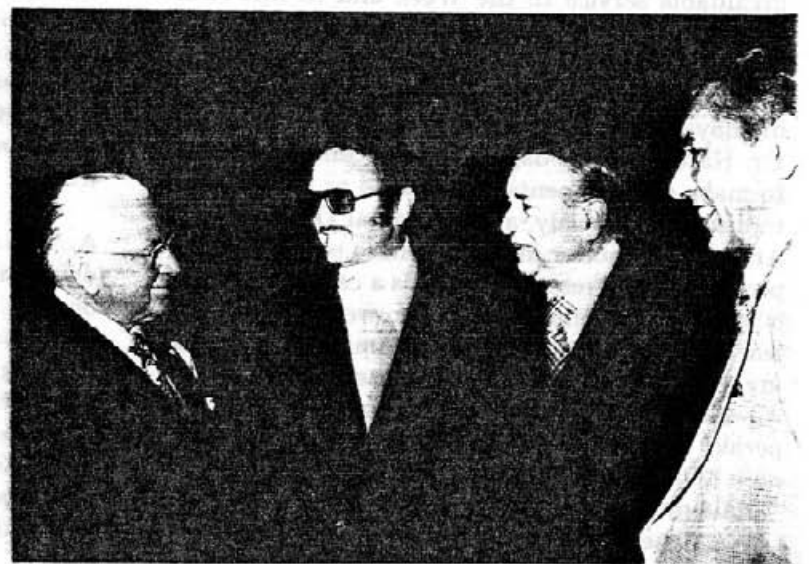
Ed. Note: Other pictures to appear in next PT which, by the way, demonstrates the quick turnaround time available with the new format.