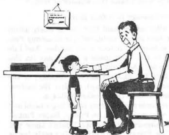
The following was asked of a minister's son whose father's office is in his home:

Sometimes we can learn by laughing at ourselves.