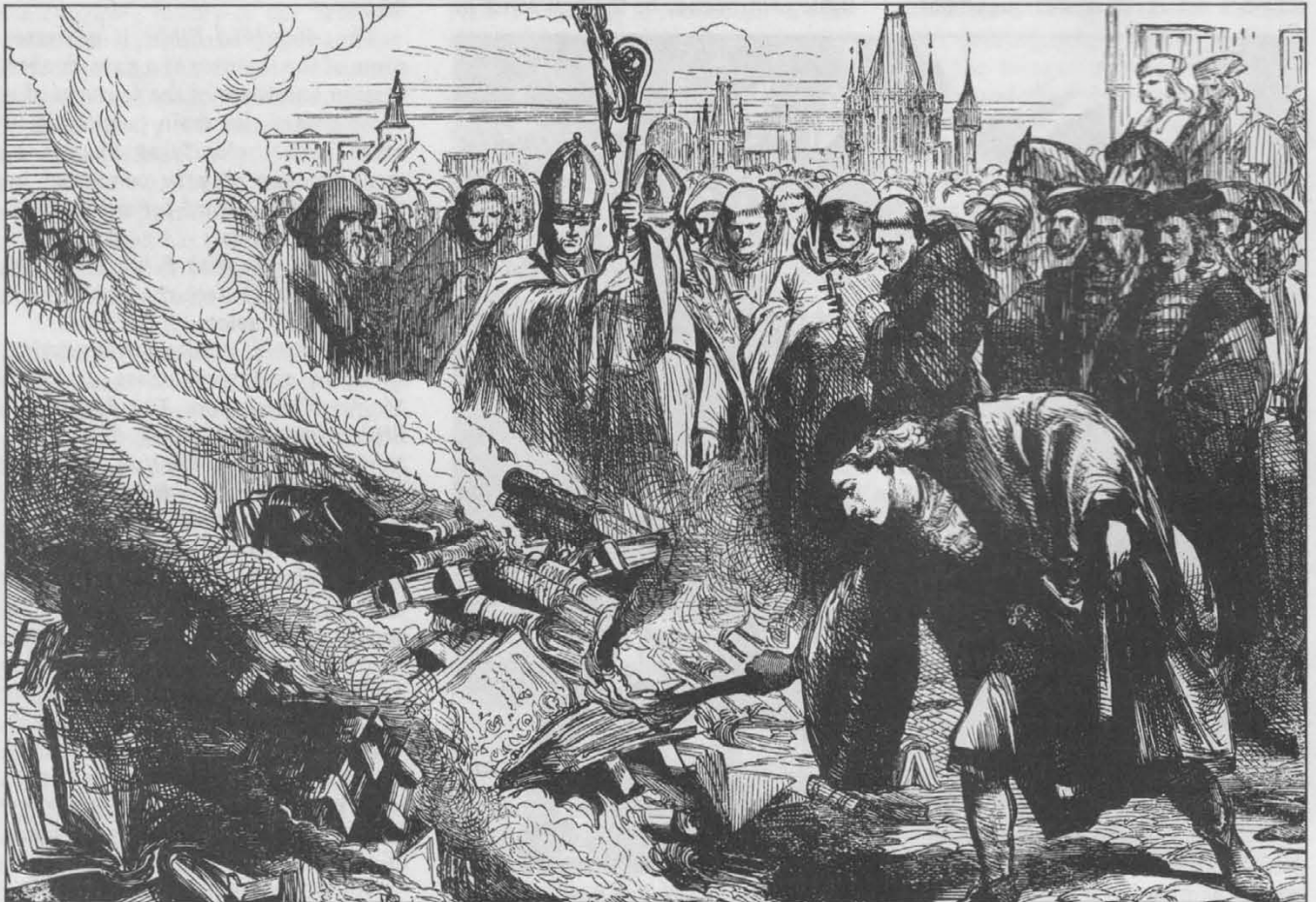
DESTRUCTION of the works of Wyclif at Prague.

Others also found it dangerous to be too closely identified with the translation or circulation of the English Bible. Coverdale narrowly escaped with his life; Cranmer and Rogers were brought to the stake; many others sought safety in flight. Even men who bought or sold these early English Bibles were threatened, sometimes tried for heresy, sometimes put to death. □