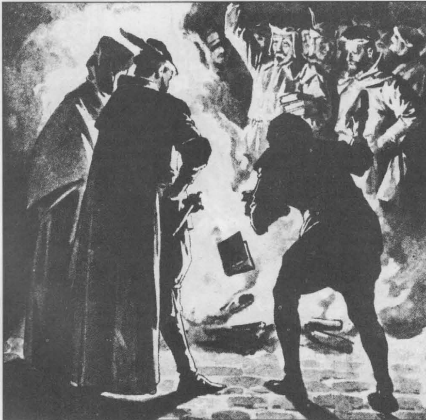
WILLIAM TYNDALE'S translation of the Scriptures are shown being burned. Vigorous measures were taken to find thousands of copies, which were burned in solemn ceremony. This was called "A burnt offering most pleasing to Almighty God."

More complete coverage of the whole subject is available in our free article, "Which Translations Should We Use?"