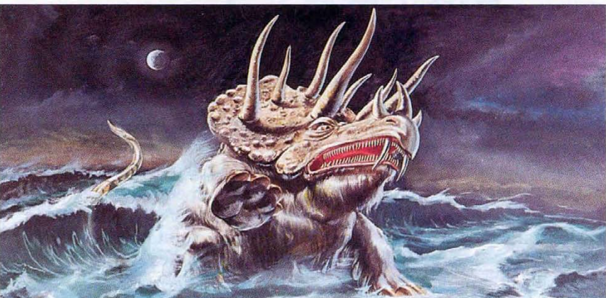
THE THIRD BEAST in Daniel's dream was followed by a fourth that was "dreadful and terrible" (Dan. 7).

civil government martyred millions who were declared "anathema from Christ" or "heretics."