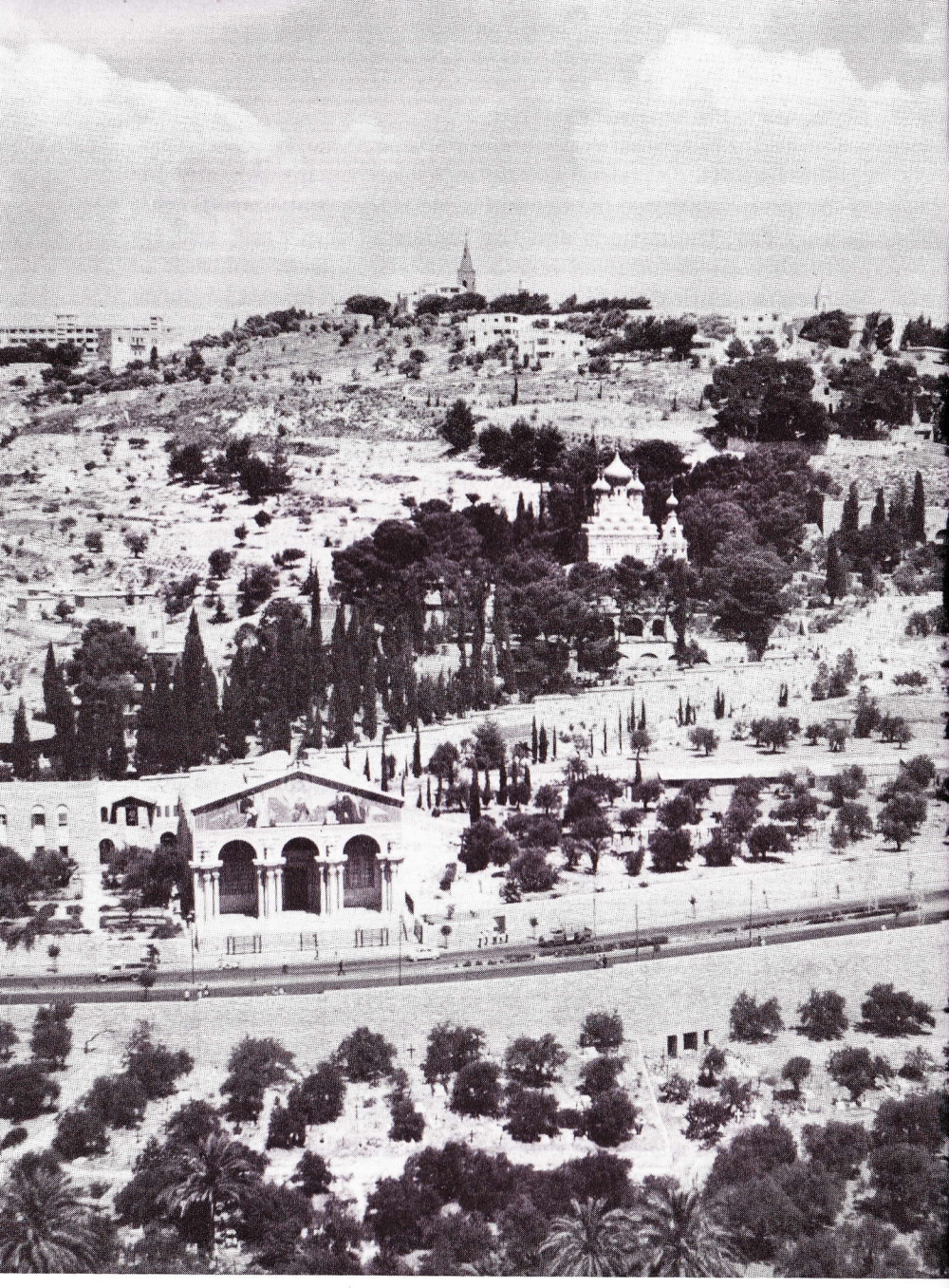
THE MOUNT OF OLIVES as it looks today. It is at this very location that Jesus Christ will soon return to earth to set up a peaceful and just world government.