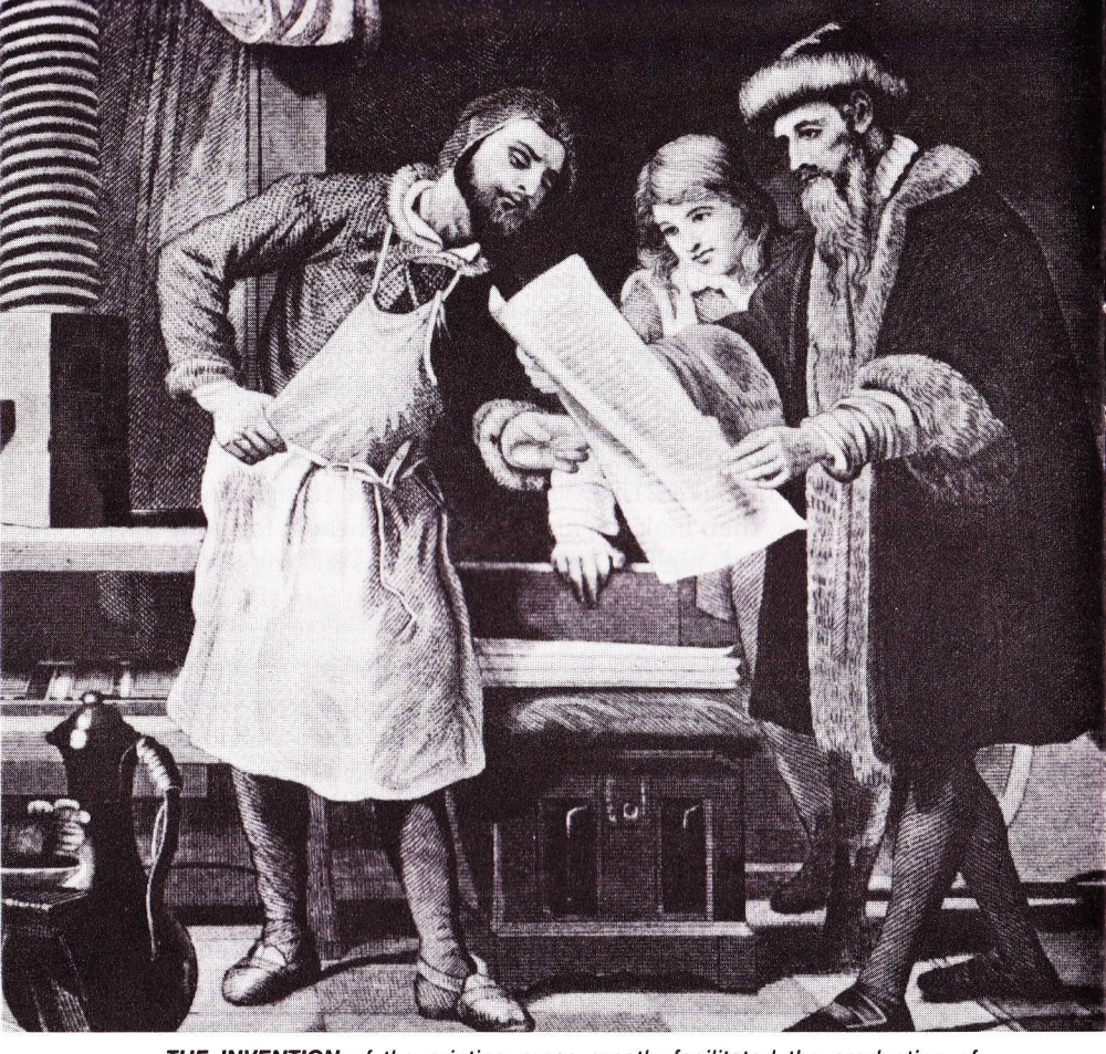
THE INVENTION of the printing press greatly facilitated the production of reading material, opening the way for the mass dissemination of knowledge and information.

knowledge and invention of mechanical facilities has multiplied with constantly increasing momentum since 1850. It is almost as if mankind first appeared on earth about 150 years ago and has been learning and progressing more and more rapidly since.