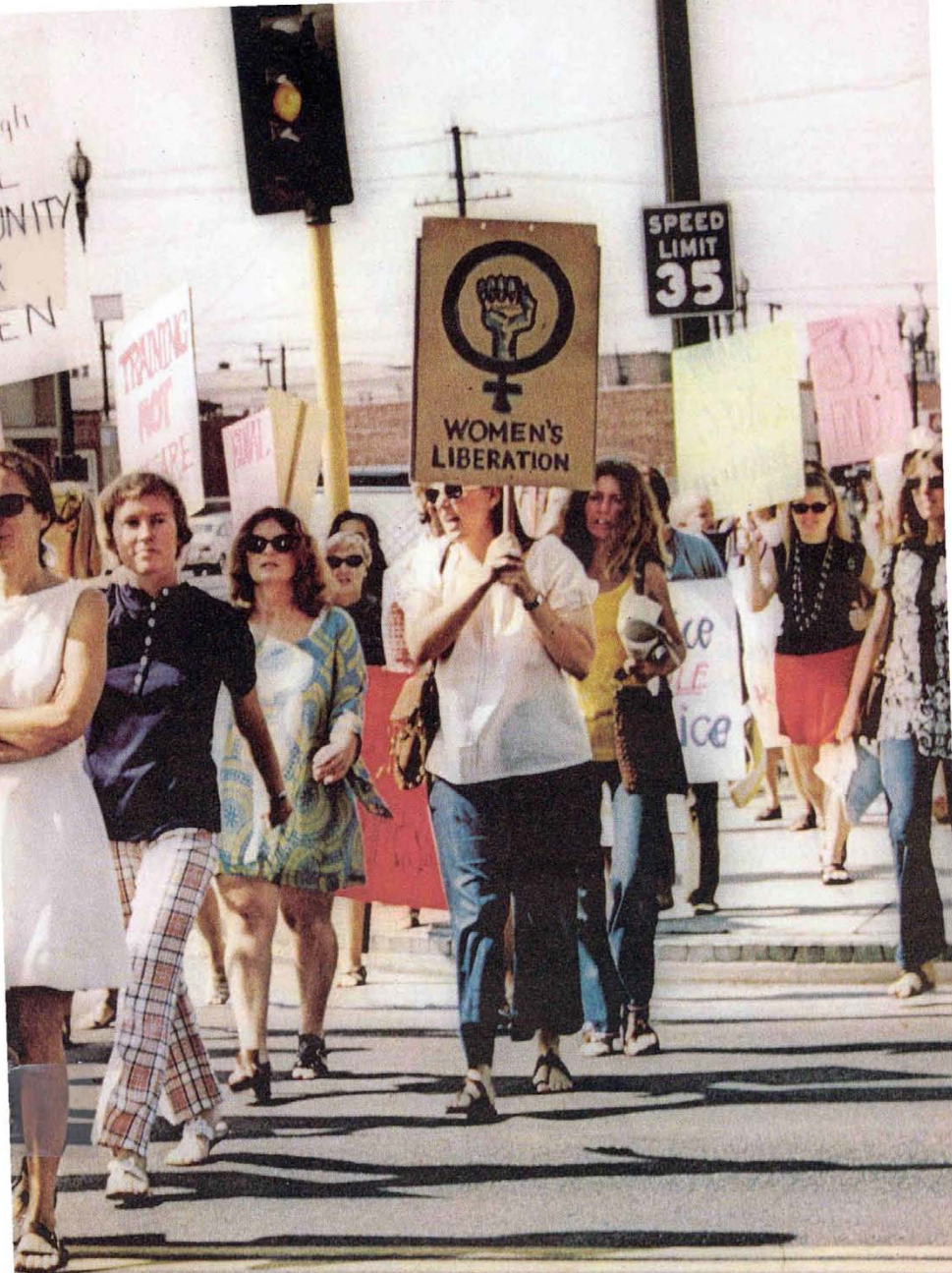
"WOMEN ON THE MARCH" — Placards show grievances of women, as they parade during "show of force."