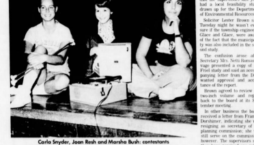
For Junior Miss title Pageant lineup adds three

EMPTY SEATS —How many seats will be empty in this auditorium the next time the Worldwide Church of God gathers in Mount Pocono is still a matter of speculation. Three couples in the Pocono area won't be there.