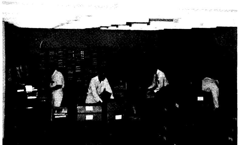
BELOW: A candid photo of the congregation at Vancouver. Services had been dismissed, but as in God's Church everywhere, the brethren were engaged in the pleasant fellowship every Sabbath affords.

mailing list has once again DOUBLED! Two more personnel have been added to the staff of office employees.