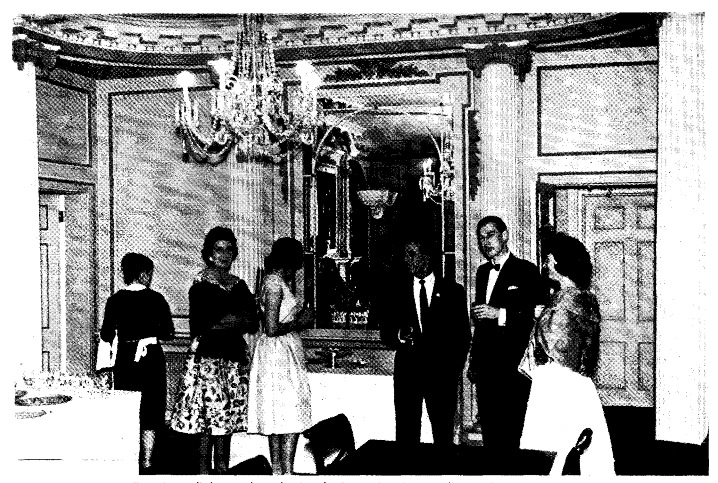
Enjoying a little punch at the Faculty Reception. Notice the gracious appointments of Ambassador's Memorial Hall.

vitally needed ministers and other leaders for God's work here.