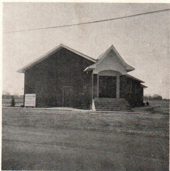
CHURCH OF GOD (SEVENTH DAY) NAMPA, IDAHO