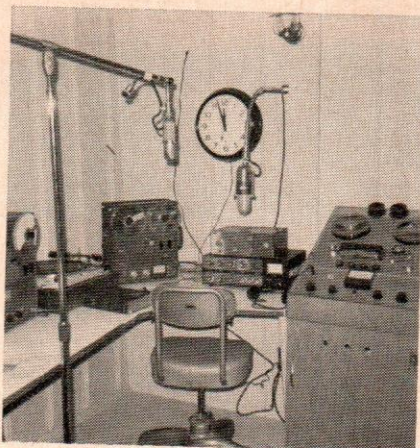
Radio equipment used to make the Searchlight Radio Broadcasts. This is in a room of Elder Padilla's home, which he has fixed with tile and drapes especially to be used for broadcasting the radio programs.

and show your interest in spreading the gospel.