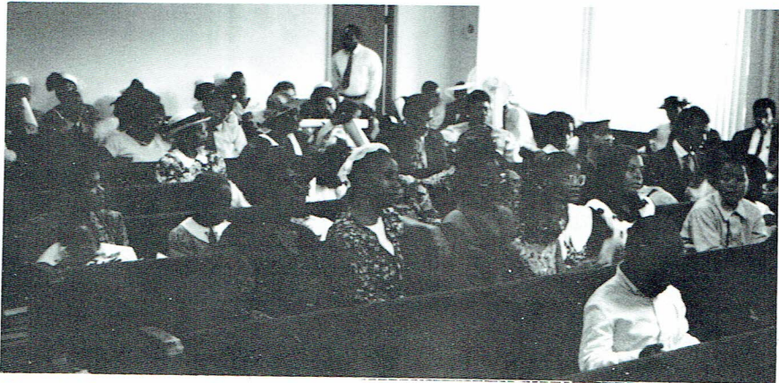
People from a number of Sabbathkeeping groups gather at Apostolic Church in Miami; sign promoting BSA is on wall in background.

By the door of the sanctuary we displayed a sign about The Bible Sabbath Association and gave out some back issues of The Sabbath Sentinel .