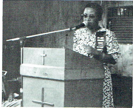
Guest speaker at commencement celebration at Apostolic Church

Of the more than 60 students in attendance, 6 were seniors graduating from high school. Each student received a Bible, a ribbon, a poster of the first Psalm, and a certificate of achievement.