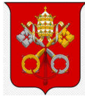
Vatican City Coat of Arms