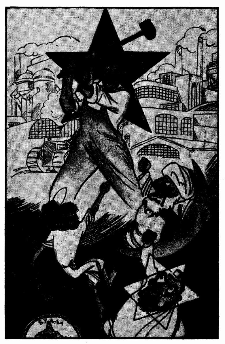
Typical Soviet Athelst Cartoon Representing the Communist "Worker", Backed by the Soviet Red Star, Smashing All Religious Faiths—Christian, Mohammedan, and Jewish.