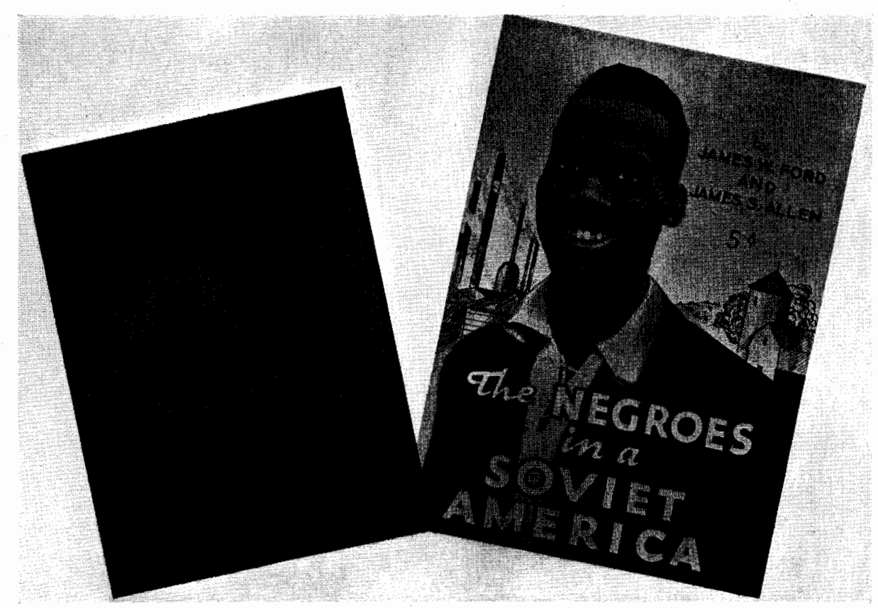
Facsimiles of two characteristic Communist Party pamphlets inciting Negro Red revolution. See page 223.