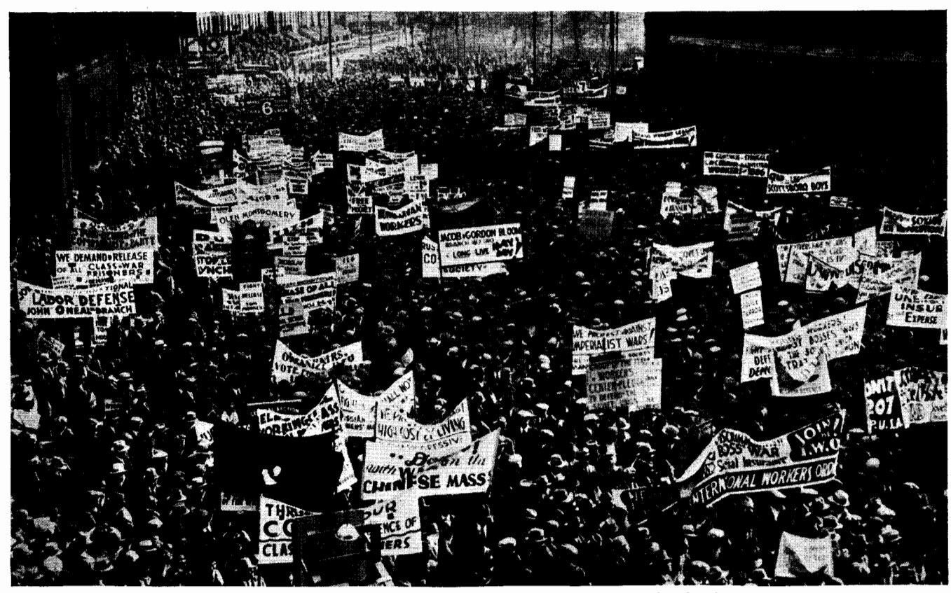
Revolutionary Communist parades, like this one in Chicago, are growing in size and number and take place frequently in the principal American cities, with a total of hundreds of thousands of America's Red enemies participating.