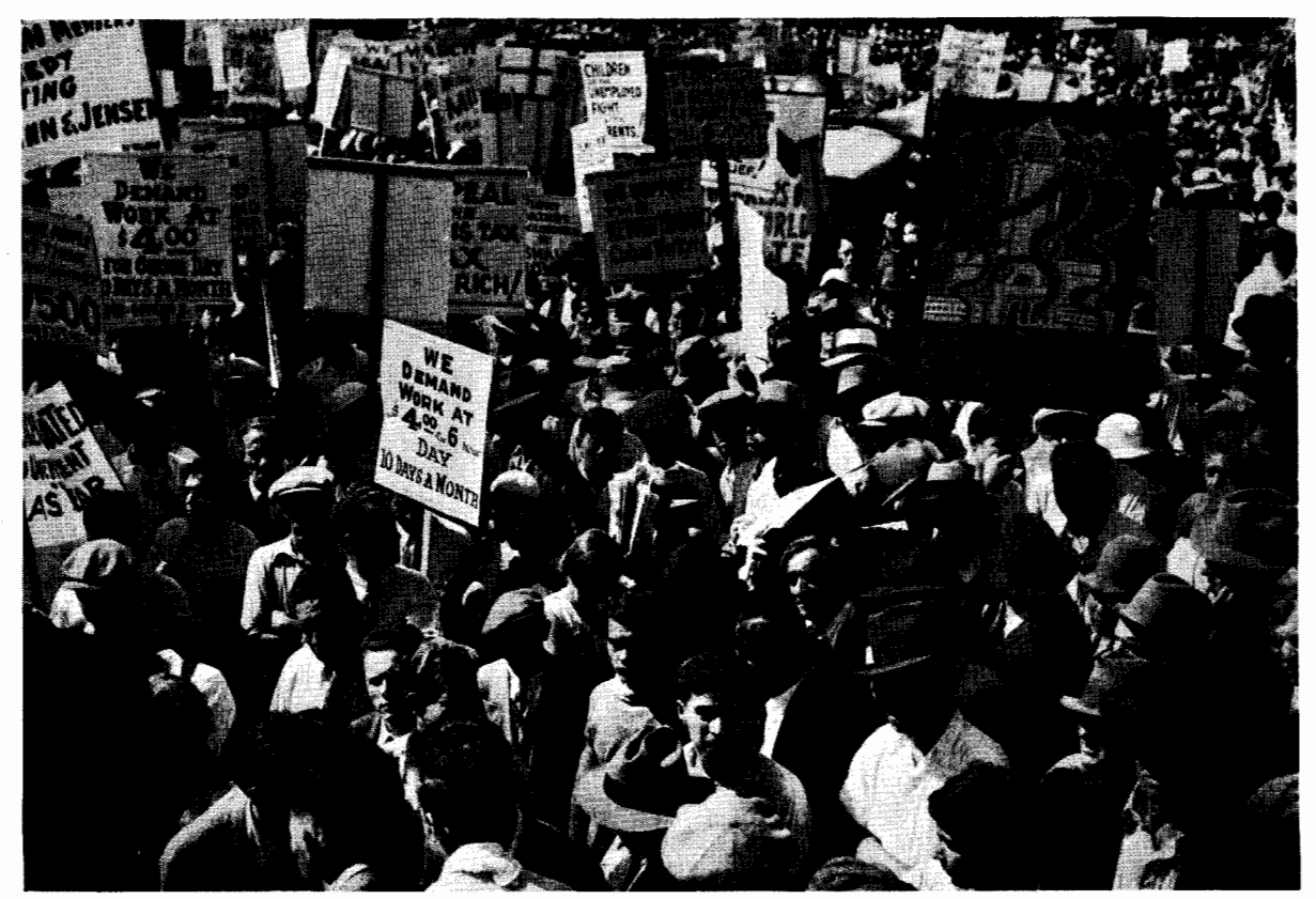
10,000 Reds Hold Mass Meeting to Plan Downfall of U. S. Government. Photo shows a section of the avowed Communist gathering at the Los Angeles Plaza. They frankly expressed their ambition to destroy the U. S. Government.