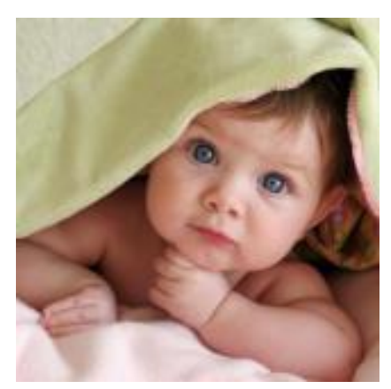
Sweet children will no longer be abused

One only has to look at the British Empire, you are taught, with its religious teachers as a forerunner of this. And how the Church operated out of Israel during the last days, to spread the True Gospel and the Israel Message because it is only the prosperity and freedoms that Israel provided which offered the Church the capacity to spread the Gospel. Israel and spiritual Israel operate in tandem (see Rom 9:3-8).