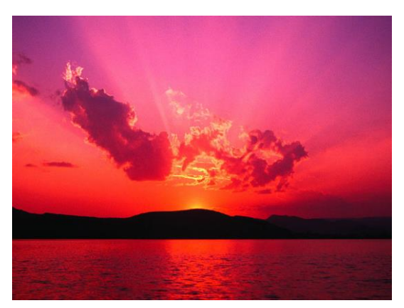
A new day will dawn and shine across the earth!

No limitation is placed upon reproduction of this document except that it must be reproduced in its entirety without modification or deletions. The publisher's name and address, copyright notice and this message must be included. It may be freely distributed but must be distributed without charge to the recipient.