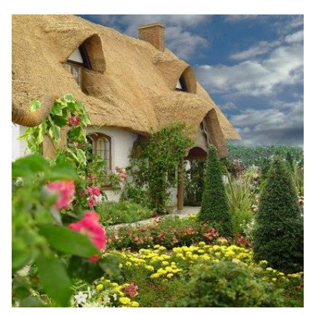
Picturesque homes in the millennium

But later on you will also be visiting Israelitish outposts in Asia as you bring to the remnants of Asia the Good News of the wonderful world of the Messiah. They, just like Israel, will be taught the need for individual and national repentance.