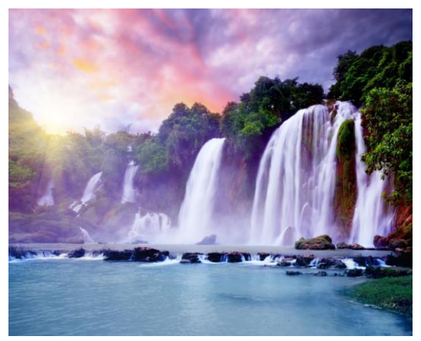
A world of breathtaking beauty and splendour takes hold all over the planet

You find that you can actually be creative and use your skills with full support instead of blocking tactics – everyone looks out for each other without the evil spirit of competition. Love is in the air and you are thrilled and energised by this positive environment.