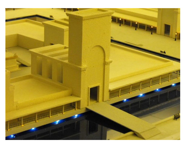
The Millennial Temple prophesied by Ezekiel

"And he said unto me, Son of man, the place of my throne, and the place of the soles of my feet, where I will dwell in the midst of the children of Israel for ever, and my holy name, shall the house of Israel no more defile, neither they, nor their kings, by their whoredom, nor by the carcases of their kings in their high places." (Ezek 43:7)