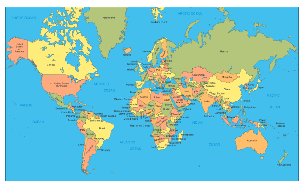
All nations and peoples will eventually be brought under the Messiah's rulership

The world is in harmony and at peace at last!