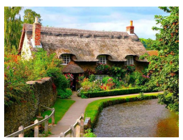
Your new home in Australia

Yet some do rebel but are quickly dealt with 16: