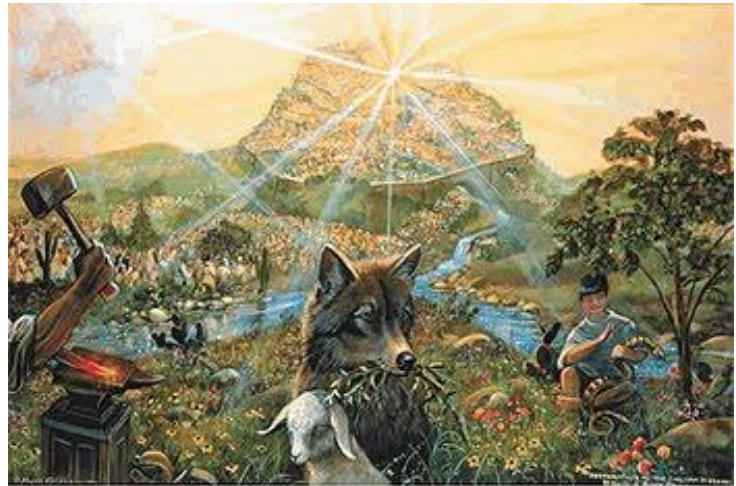
A depiction of the Millennium by an unknown artist. Jerusalem is shown in the background, lifted up as the highest place on planet earth (Isaiah 2:2 and Zechariah 14:10). The glory of the Lord beams forth from Jerusalem (Isaiah 24:23), and people come from all over the world to worship the King of kings (Zechariah 14:16-18). Swords are hammered into plowshares (Isaiah 2:4), the wolf dwells peaceably with the lamb (Isaiah 11:6), and children play with cobras (Isaiah 11:8).

One of the pillars for the economic system is a sound government, business and private finances. All levels of government are required to have balanced budgets and businesses and families are taught to live within their means, to avoid debts but if debt does arise, to keep debt levels very low and to pay it off to the lender.