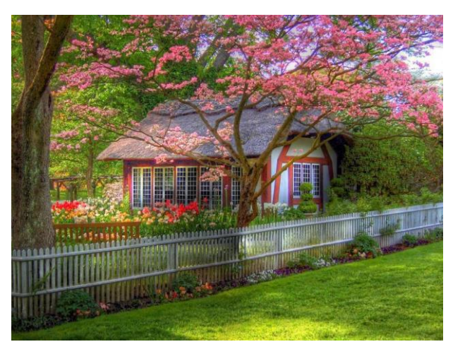
Lovely new homes in the Holy Land

No more accepting a salary for something they don't believe in and refuse to uphold the doctrines and policies of the organisation employing them. Deviousness and lying are no more because they will not be tolerated. Today they are tolerated because too many in leadership positions have 'something on the other guy' hence they cannot make a move against corrupt or unethical individuals.