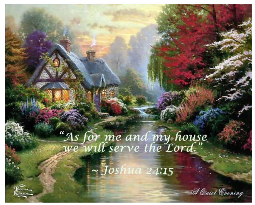
Awesome beauty will prevail during the Wonderful World Tomorrow – for everyone will serve the Messiah