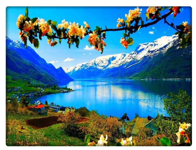
The lands of Israel will be re-populated after the inauguration of the Temple

The understanding is clear to you that the concepts of Christ, His body the Church and physical Israel are inextricably intertwined very closely in scripture – possibly more than had been realised.