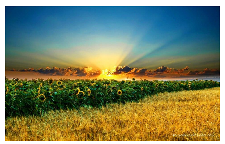
A radiant new world without Satan and his cohorts

In fact, you are taught that one cannot take the philosophies of Satan's world and super-impose them on the Bible and try and make out that the Bible supports such views – such as socialism, laissez faire, feudalism and so on. Some aspects of these may seem to have worked in the world yesterday – but NOT in the world tomorrow which is based on love and outgoing concern for others, not the supposed 'selfish gene.'