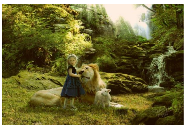
Your daughter playing with the animals! (Is 11:5-9)

So what happens next? What joys, splendour, prosperity – and in particular spiritual experiences – await you and your daughter?