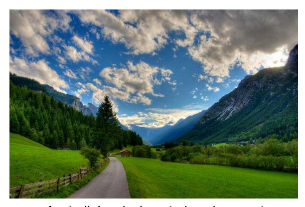
Australia's reinvigorated environment

Kiss the Son, lest he be angry, and ye perish from the way, when his wrath is kindled but a little. Blessed are all they that put their trust in him." (Ps 2:1-12)