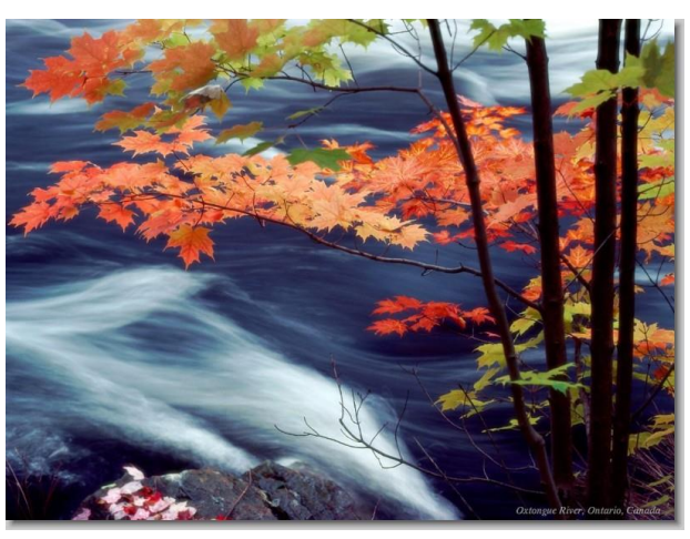
The world will be like a new Garden of Eden

They shall not hunger nor thirst; nor shall the heat nor sun strike them; for He who has mercy on them shall lead them; even by the springs of water He shall guide them." [the Second Exodus] (Is 49:6-10)<sup>14</sup>